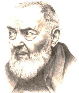
St Pius of Pietrelcina (Padre Pio)

On Sunday 23 August at the 9.30am Mass, we will enthrone in our church the First Class relic of St Ezekiel Moreno, patron saint of cancer patients and the Second Class relic of Padre Pio, patron saint of adolescents and stress relief.