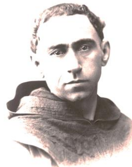
St. Ezekiel Moreno